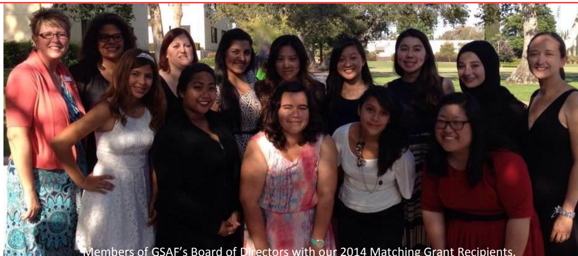
Members of GSAF's Board of Directors with our 2014 Matching Grant Recipients.